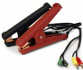
DRM-4017-35™ Optional Kelvin clamp kit