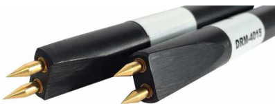
DRM-4015™ Optional Double Hands probe kit