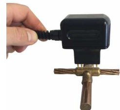
DRM-4012™ Optional Exothermic welding test probe (Cadweld®)

Different test probes and accessories are available with micro ohmmeters